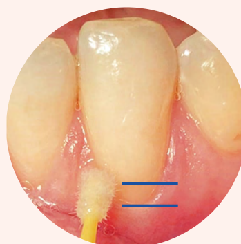
Gingival recession of about 3 mm

A 36-year-old woman. The patient has complaints about sudden severe pain from temperature irritants in the cervical area of tooth 3.3